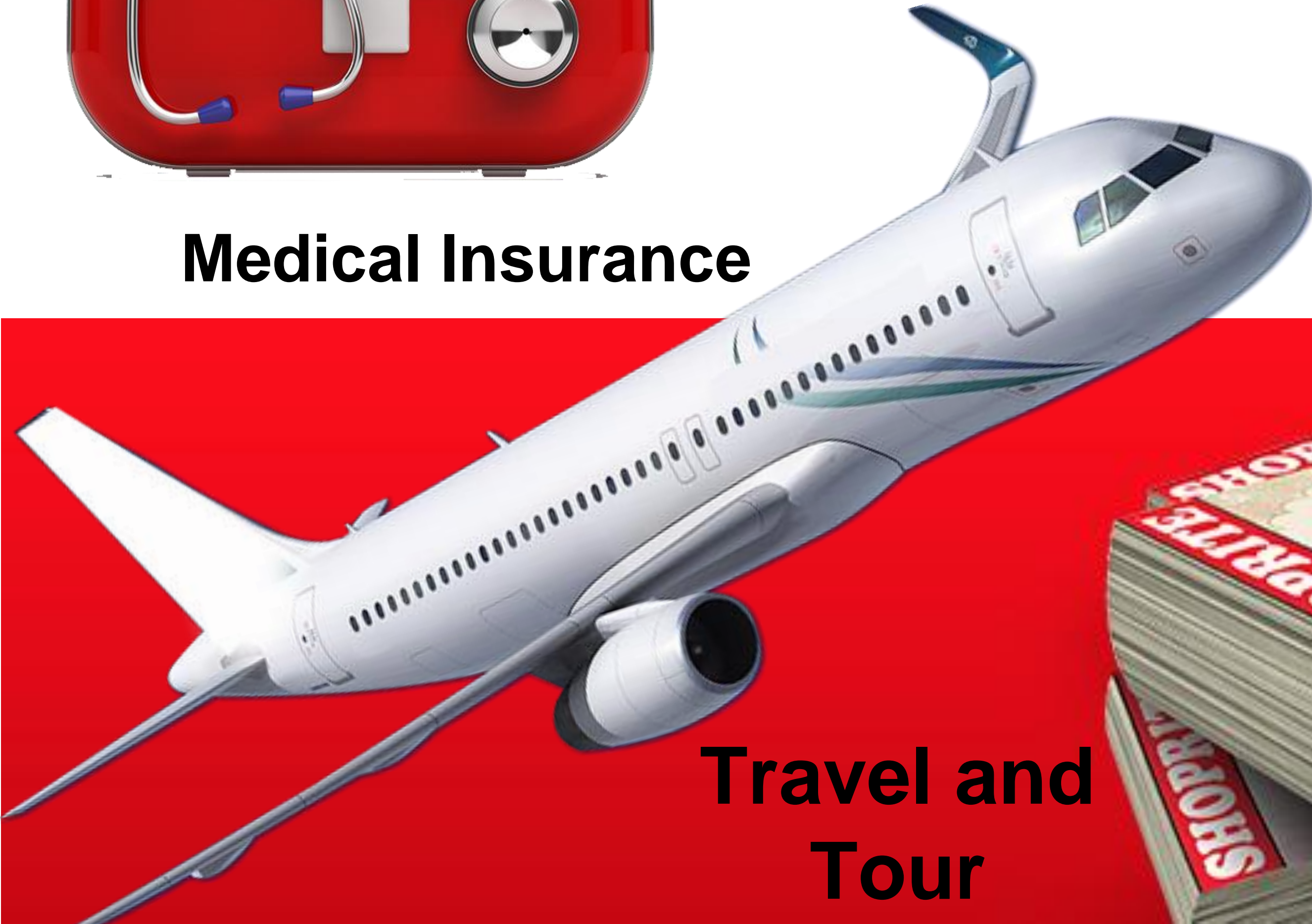
Travel and Tour