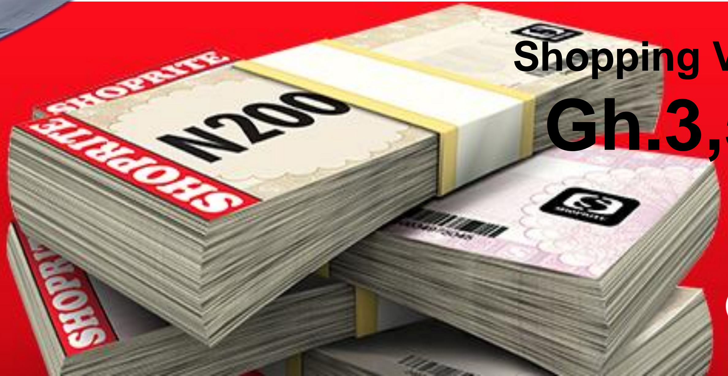
Shopping Voucher Gh.3,500