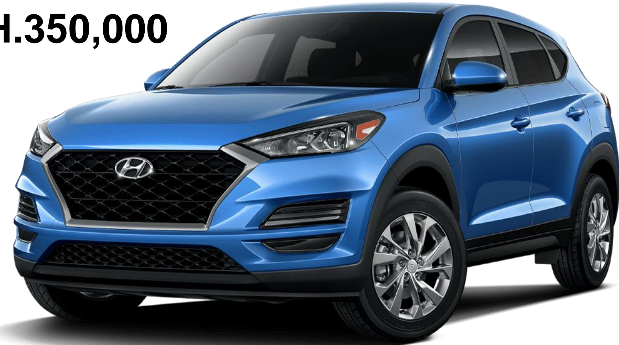
Car worth GH.350,000